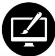
School of Design & Applied Arts