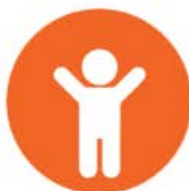
Early Childhood Education