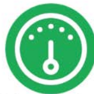
School of Transportation Technology