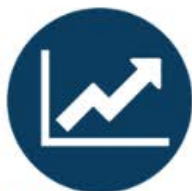
School of Business & Entrepreneurship