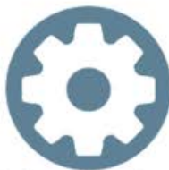
School of Manufacturing