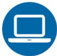
School of Information Technology