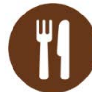
Culinary & Baking Arts